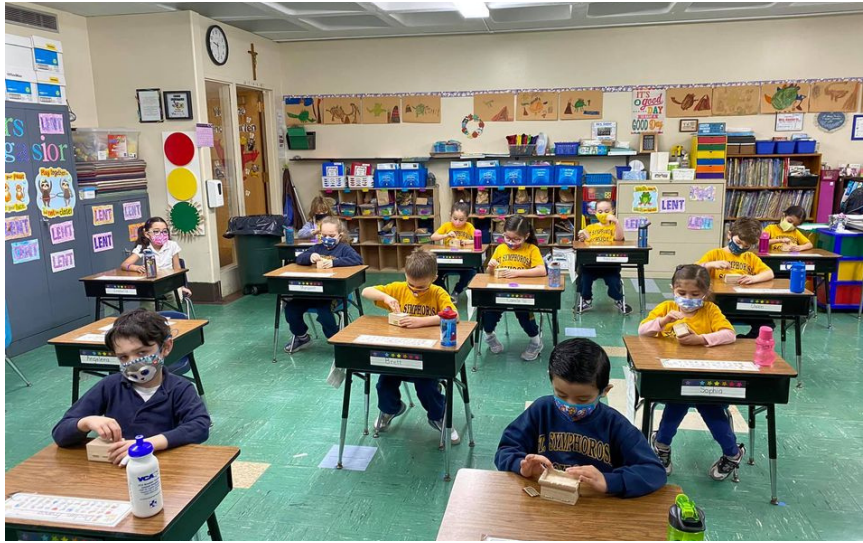
Kindergarten students sanding their Lenten Treasure Boxes.