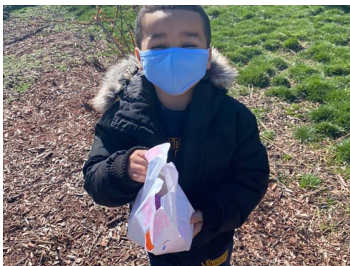
A happy Pre-K student hunts for Easter Eggs in the Maniola Garden.